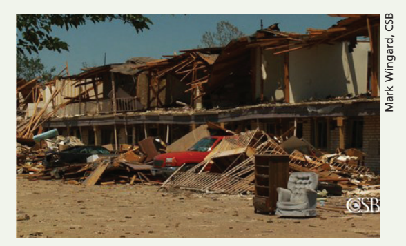
An apartment building in West, Texas destroyed by the April 17 explosion.

The State of Texas prohibits county governments with fewer than 250,000 residents from adopting their own fire codes. In these locales, adopting more stringent fire protections are voluntary and Adair Grain, Inc., the owner of West Fertilizer, had not adopted any.