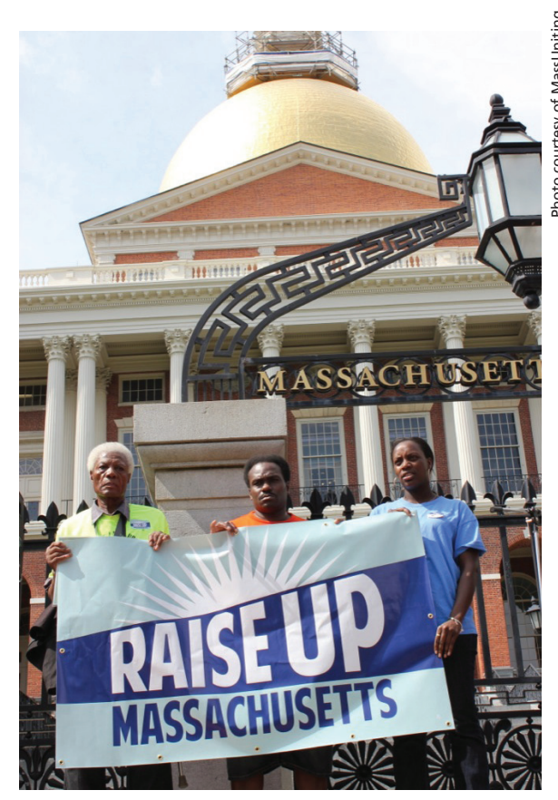
The Raise Up Massachusetts Coalition is working to get measures onto the state's ballot to increase the minimum wage and assure workers' ability to earn sick time.

The Progressive States Network reports that in 2013, 19 states and the District of Columbia have minimum wages above the federal $7.25/hour requirement. See their map of state minimum-wage laws at http://bit.ly/1aLkssl.