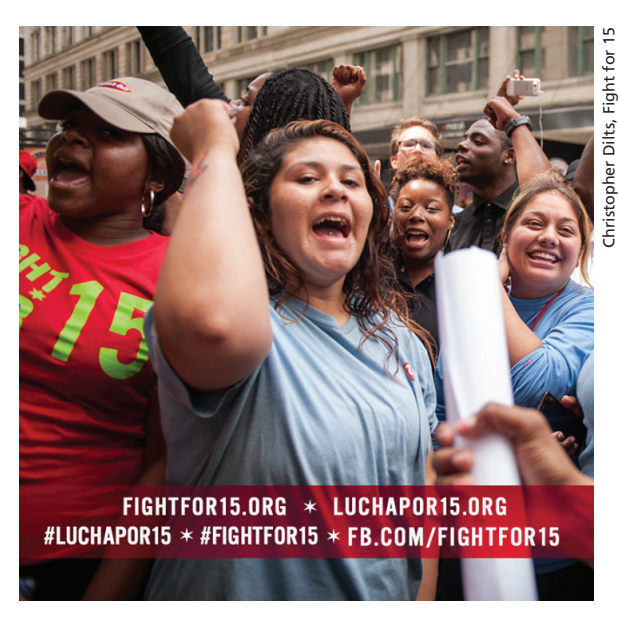
Fast-food workers in Chicago and other cities have walked off the job on one-day strikes to demand better wages and working conditions

The financial struggles of workers in full-service restaurants are also gaining wider recognition, thanks to the Restaurant Opportunities Center (ROC)-United. Co-founder Saru Jayaraman released her book Behind the Kitchen Door (Cornell University Press) on February 13, or 2/13 – a date that has special significance in the restaurant world, where the hourly wage of most tipped restaurant workers has been stuck at $2.13 per hour since 1991. Workers' tips are supposed to be sufficient to bring their hourly wage up to the minimum wage; when they don't, employers are supposed to make up the difference, but restaurant workers report that they're often left with belowminimum-wage earnings. ROC affiliates in cities across the country help workers fight for better employment conditions while also highlighting "high road" restaurants that create "win-win" solutions for workers, diners, and employers alike.