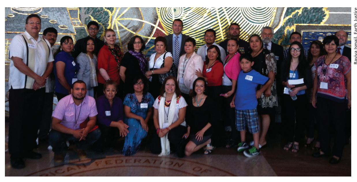
Farmworkers converged on Capitol Hill to urge action on updating EPA's Worker Protection standard.

their advocates. Today, undocumented workers are vulnerable to exploitation by employers, who may threaten workers with deportation if they complain about violations of wage or health and safety laws. The Senate bill allows undocumented workers already in the country to apply for legal status and eventual citizenship. It also creates a new "W visa" program for immigrant workers to fill low-skill jobs, and employers can lose eligibility to hire immigrants through this program if they repeatedly or willfully violate wage and overtime rules or if repeated or willful violations of child-labor or health-and-safety regulations lead to a worker's injury or death. As of this writing, the U.S. House of Representatives has yet to vote on this or other immigration-reform legislation.